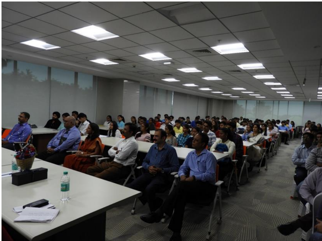
Students and faculty members seated during the Inauguration session