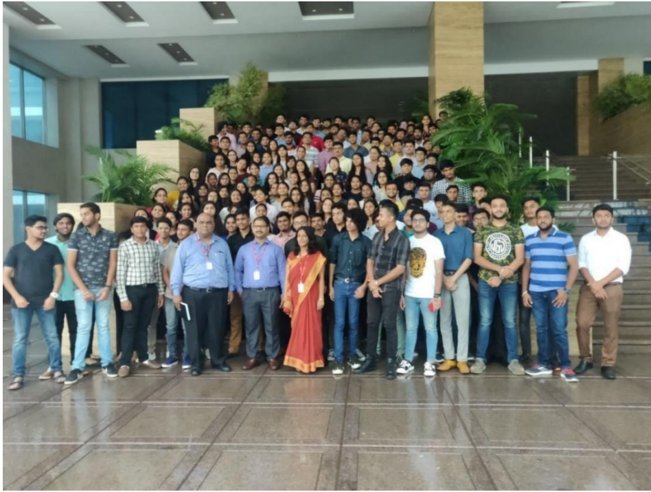
BBA and B.Com. (Hons.) - Batch of 2019-2022 with faculty of School of Commerce